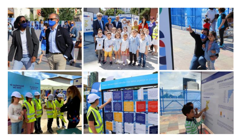
For more information on the activity, visit UNDP social media accounts: